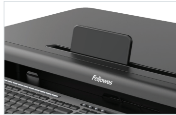
Convenient device channel